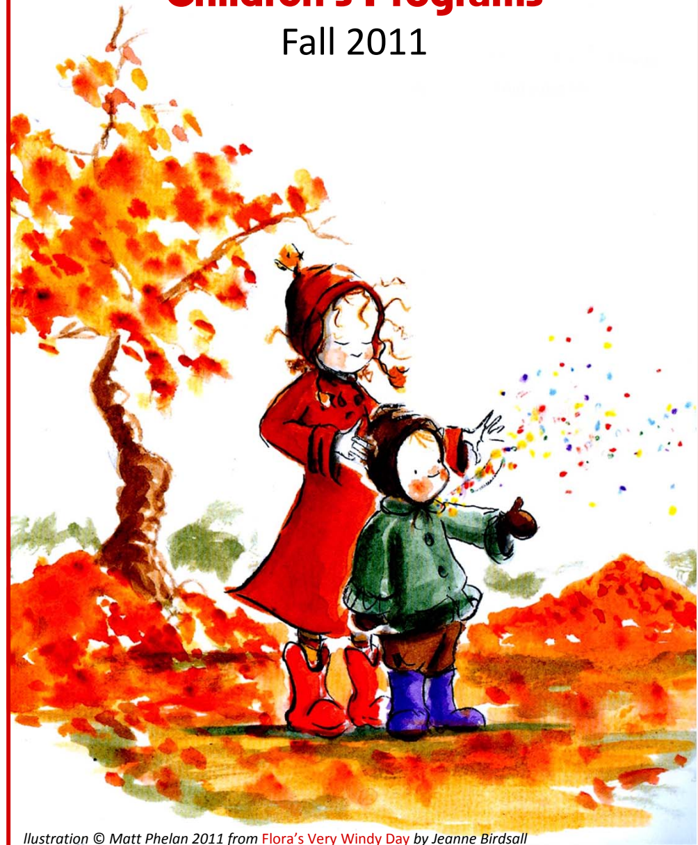
Illustration © Matt Phelan 2011 from Flora's Very Windy Day by Jeanne Birdsall