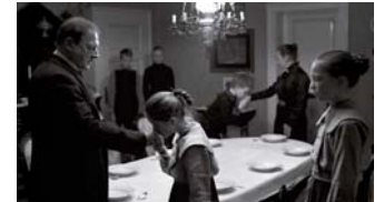
The White Ribbon