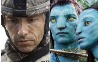
The Hurt Locker; Avatar