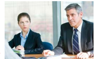
Up in the Air